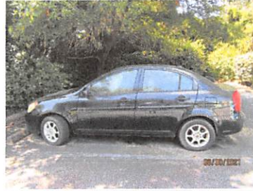
6803 N Kings Hwy