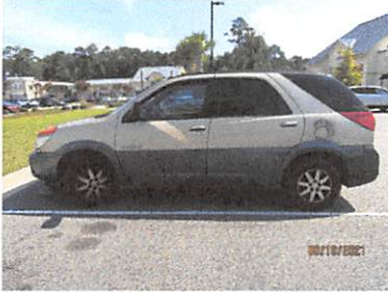
3620 Walton Dr.