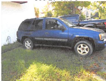
306 21 st Ave S