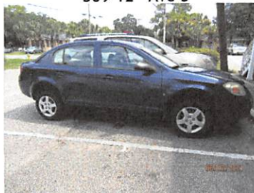
309 12 th Ave S

THE CONSTRUCTION SERVICES DEPARTMENT, CODE ENFORCEMENT DIVISION HAS TAGGED THE FOLLOWING VEHICLES IN ACCORDANCE WITH ARTICLE 41, CHAPTER 5 TITLE 56 OF THE S.C. CODE OF LAWS. SEVEN DAYS HAVE ELAPSED SINCE TAGGING AND THE VEHICLES HAVE NOT BEEN REMOVED. THIS FORM IS FORWARDED TO THE POLICE DEPARTMENT FOR FURTHER ENFORCEMENT ACTION AND DISPOSITION.