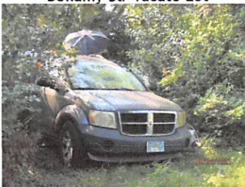
Bellamy St/ Vacate Lot