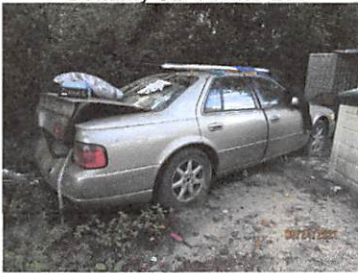
Bellamy St/ Vacate Lot