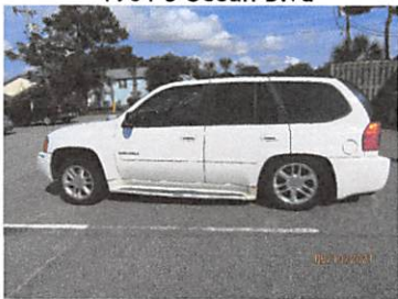
1901 S Ocean Blvd