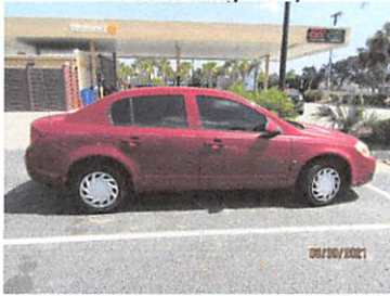
3915 N Kings Hwy