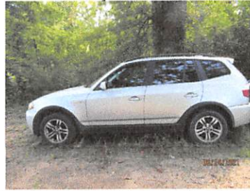
Bellamy St/ Vacate Lot