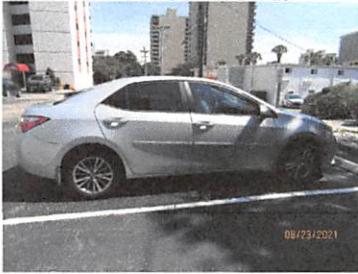
7509 N Ocean Blvd.