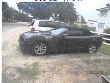
505 32 nd Ave N