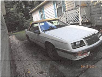
817 Jensen Ln.