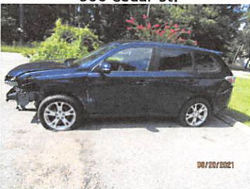
306 Cedar St.