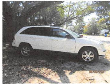
606 19 th Ave N.