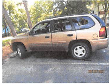
209 Cedar St.