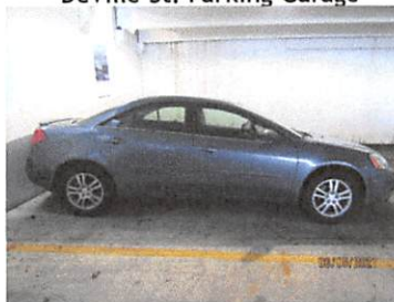
Deville St. Parking Garage